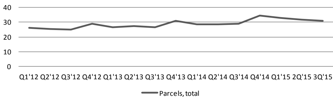
Parcel volumes, millions of units

Year-on-year net sales for the Logistics business area were unchanged during the quarter. E-commerce is continuing to show strong growth and parcel volumes rose 9% during the quarter, of which the number of e-commerce-related B2C items increased by 13%. Volumes rose in Sweden and Denmark but displayed a decline in Norway. The tough price competition in logistics is subduing sales growth.